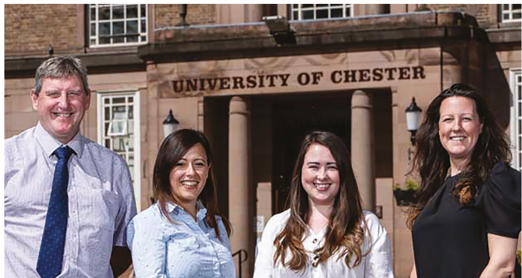
The team at the Westminster Centre for Veterans' Research (photograph taken prior to lockdown).

The funding to support this programme has been awarded by Forces in Mind Trust, and will identify numbers only, and personal data will remain confidential.