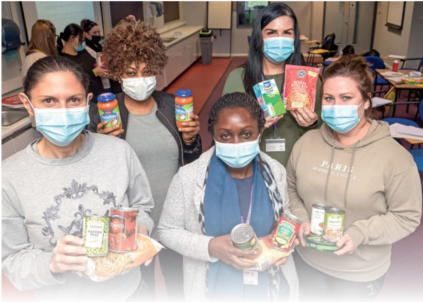
■ Students gather items for the Warrington Foodbank.