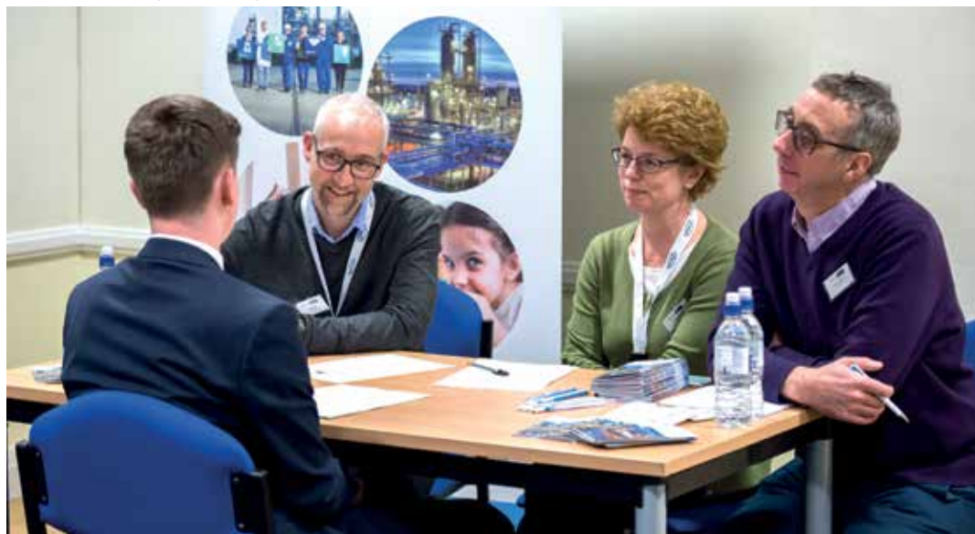
Students being interviewed by representatives from Vynova.

Chester's Faculty of Science and Engineering, and the event's organiser, said: "This year's event was the biggest and best it has ever been. We're expecting more than 40 work placement opportunities to have come from a single evening's speed networking! Our thanks go to all those companies who came along and supported the event - and, in doing so, also supported our students."