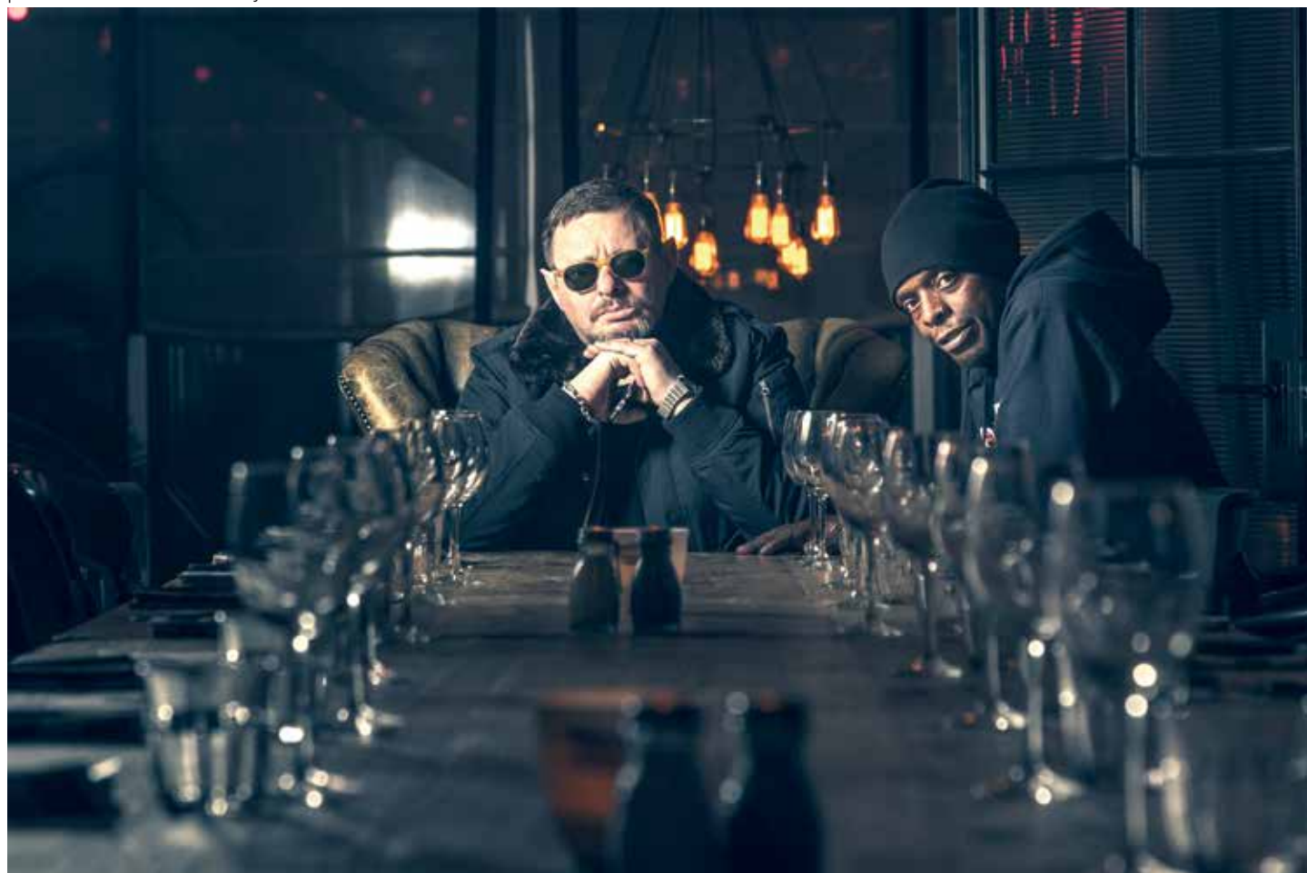
Shaun Ryder's Black Grape.