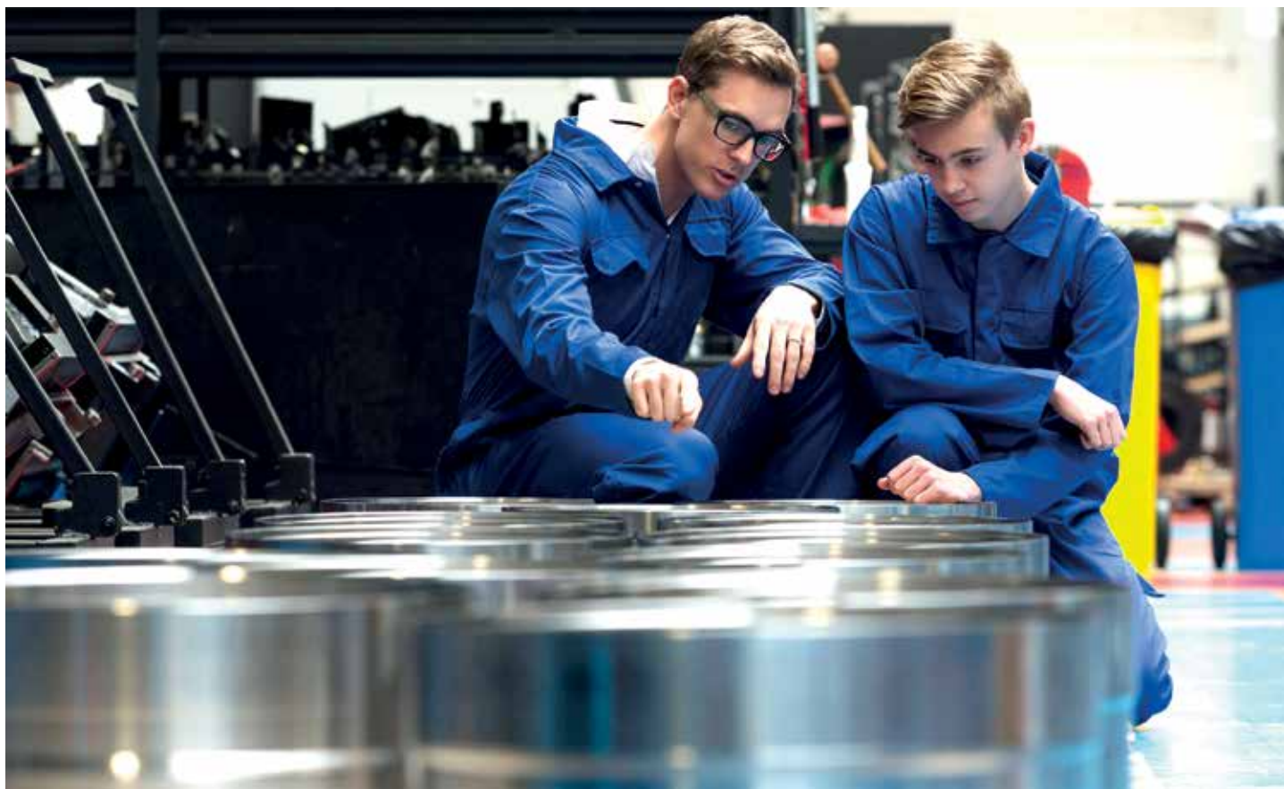
A number of five and 10 week internships are being offered through the University of Chester.

Businesses looking for a researcher to carry out a project or even a graduate to assess the company business plan, to include a low carbon aspect, can visit the Eco-Innovation website www.chester.ac.uk/ecoinnovation for more information.