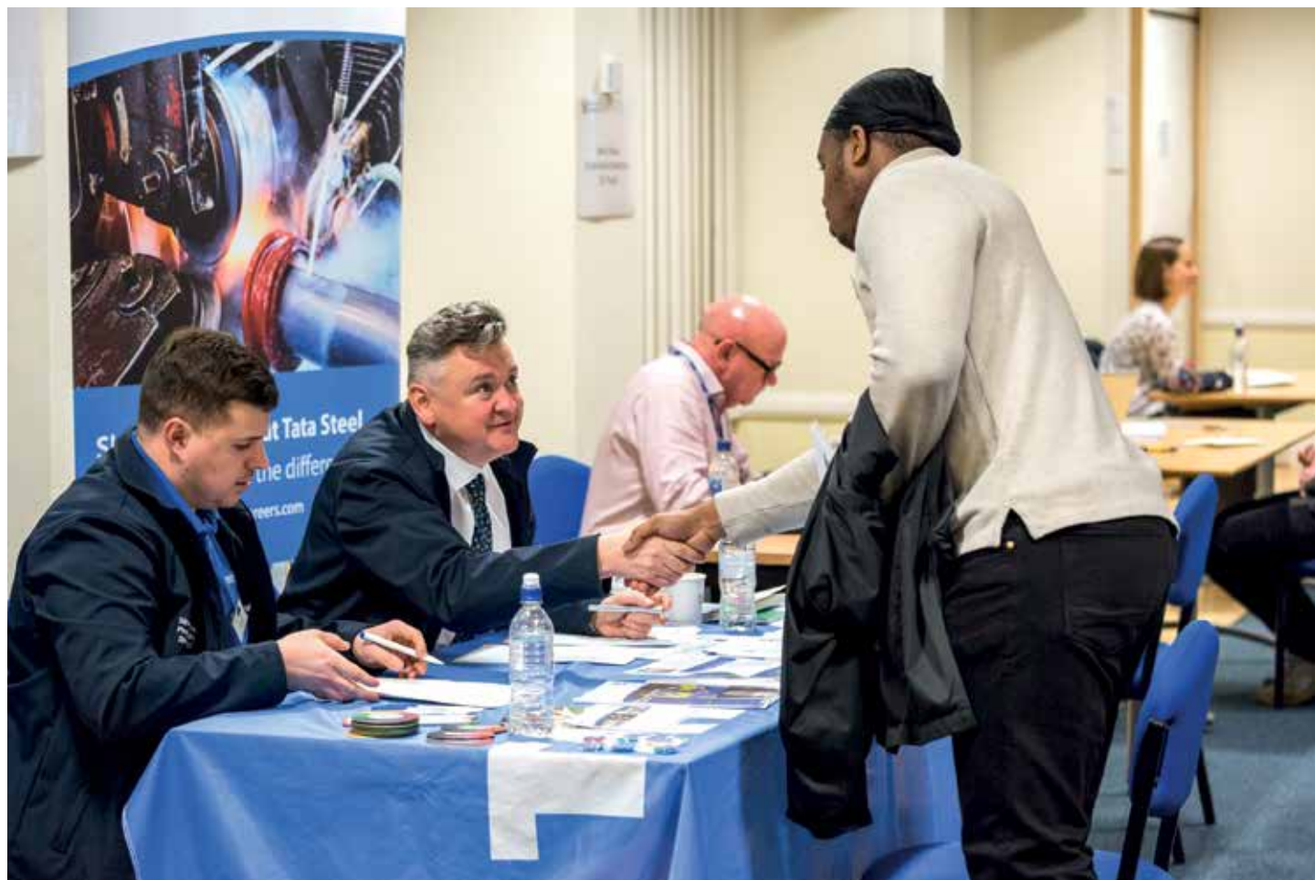
Students being interviewed by representatives from Tata Steel.