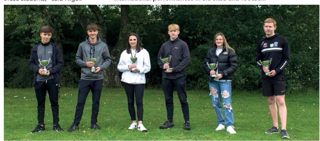
Some of the winners from Sport Priestley's annual awards.